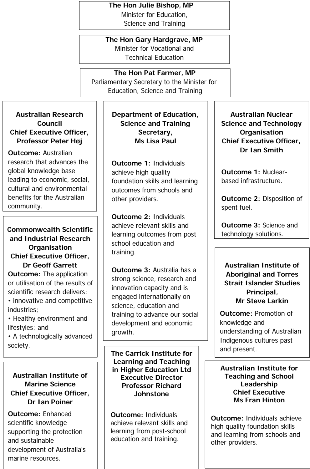
Figure 1: Portfolio structure and outcomes